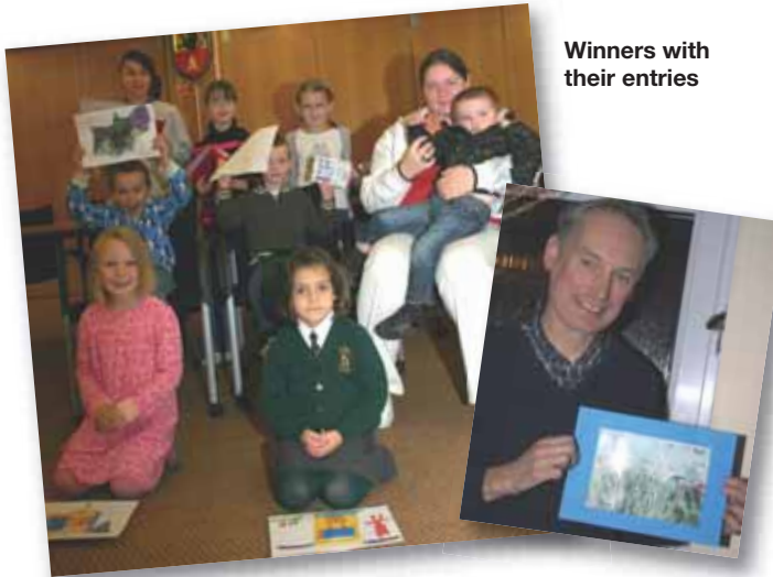
Winners with their entries

All received £20 gift vouchers. Congratulations!