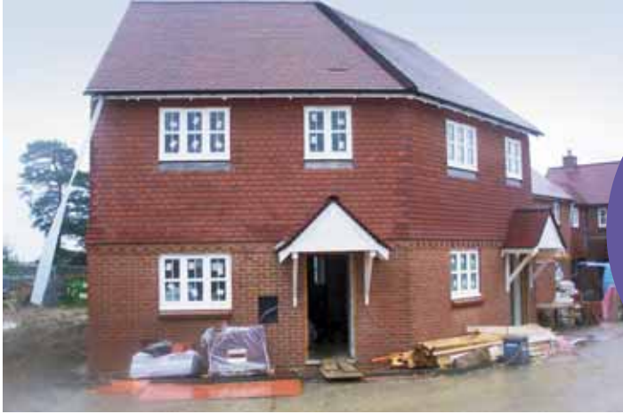
New homes under construction in Rolvenden

2009 has seen lots of activity with our housing association partners and parish councils in developing more affordable housing for local people in the rural areas of the borough.