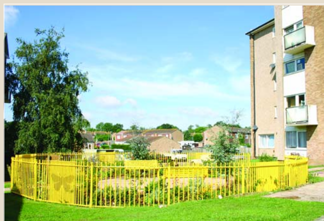
The Jubilee Garden has brightened up Bybrook, but how else can we improve the area?

This development, along with the development of former garage sites at St Stephen's Walk and Hampden Road, will provide a total of 33 new affordable homes for the borough.