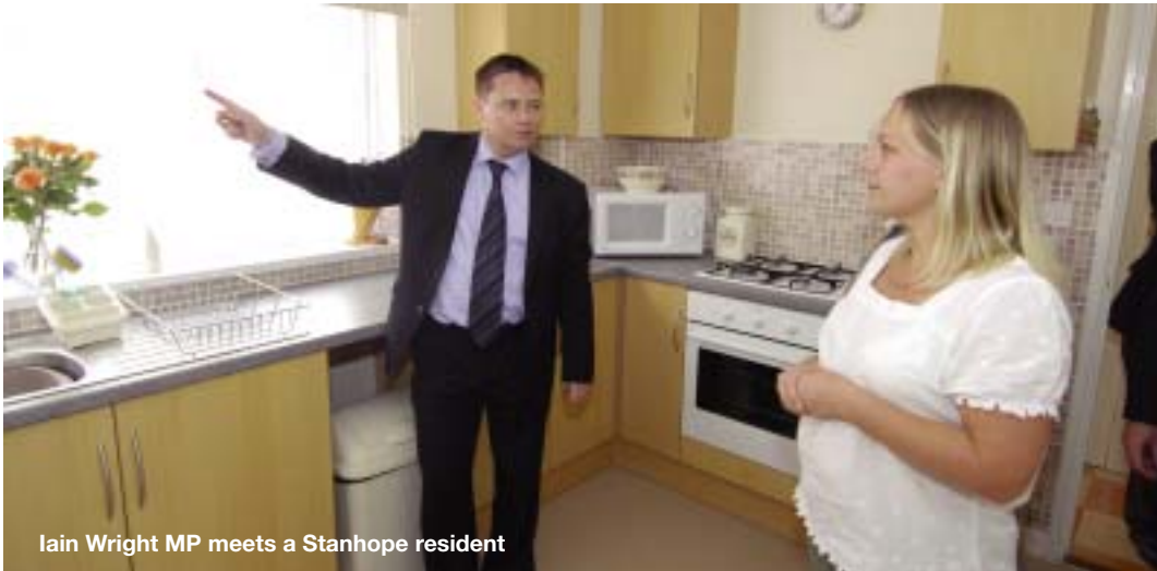
Iain Wright MP meets a Stanhope resident