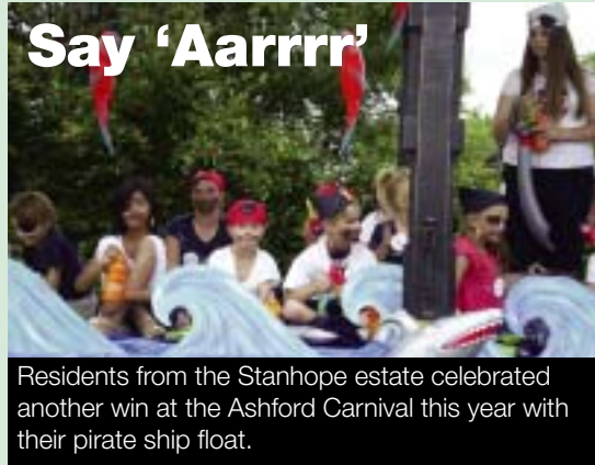
Residents from the Stanhope estate celebrated another win at the Ashford Carnival this year with their pirate ship float.

He was taken on a tour of the estate, visiting a tenant whose property had been refurbished and looking around a new-build house, and also called in on the National Skills Academy for Construction.