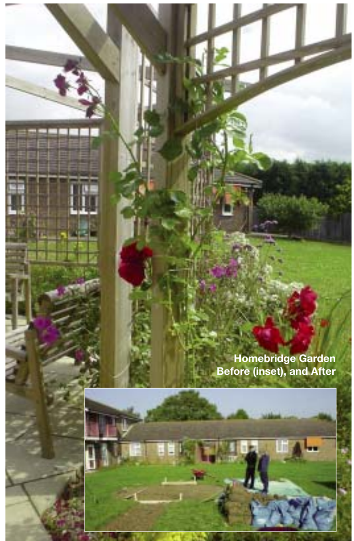
Homebridge Garden Before (inset), and After

Get in touch with the Housing Services Team by calling 01233 330688 or email us at housing@ashford.gov.uk