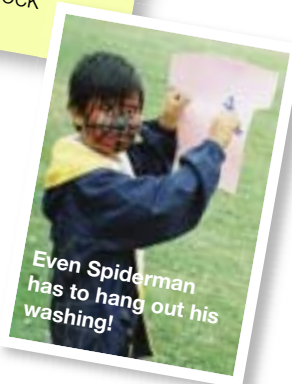
Even Spiderman has to hang out his washing!