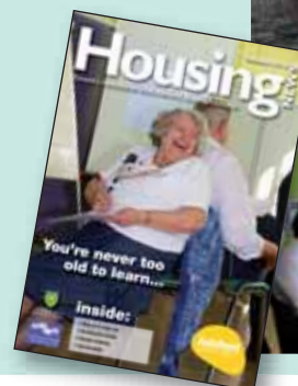
Cover Picture: Daphne Maynard enjoying a recent seniors training workshop.

If you know someone who is blind or partially sighted who would like to listen to Housing News on cassette or CD, then please contact the Editor on 01233 330365 .