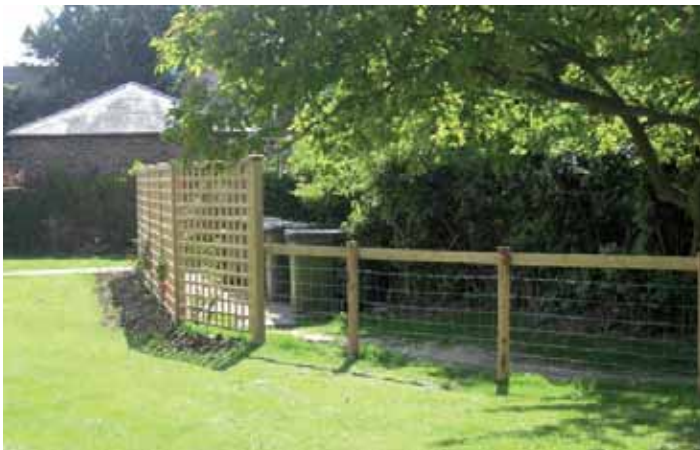
Communal bin area improvements at Gregory Court