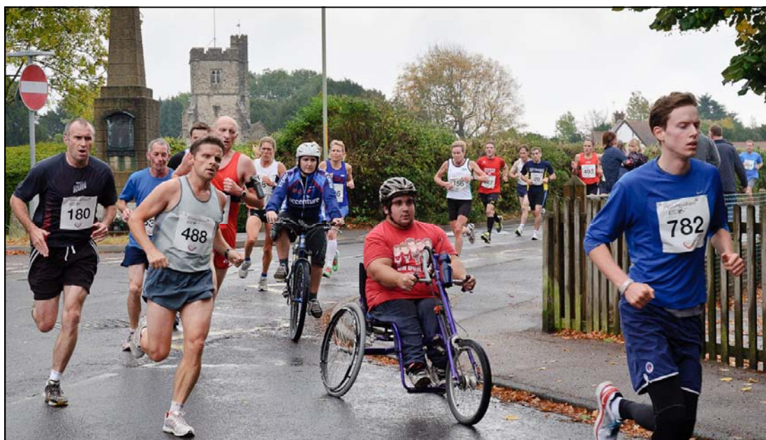
On the run: Competitors speed through Kennington in the Givaudan 10k road race