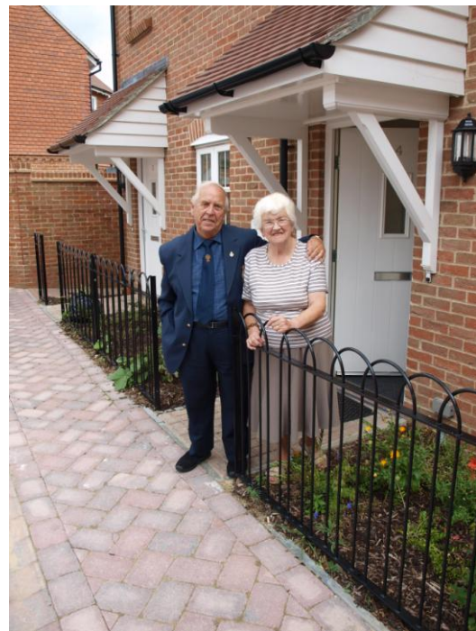
English Rural Housing Association

This information can then be used throughout the development process to help Registered Providers ascertain how many houses to build within a development, what type of properties would be in demand, whether rental or shared ownership properties are most appropriate etc. This can then be used in support of planning applications.