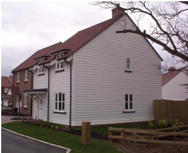
English Rural Housing Association