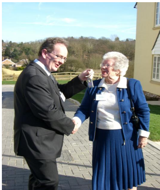
English Rural Housing Association