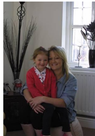
Ashford Borough Council

Once an application has been received for an affordable home, the Parish Council should be consulted on and provide information to the local housing authority or the Registered Provider verifying an applicant’s local connection.