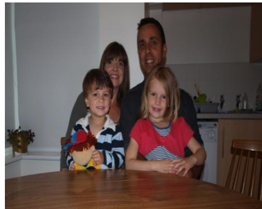
English Rural Housing Association

Affordable local needs homes are provided by Registered Providers and most are either rented or shared ownership, where the occupier part-buys and part-rents the property.