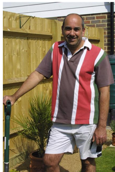
Ashford Borough Council