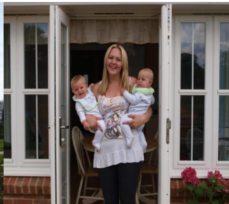
English Rural Housing Association