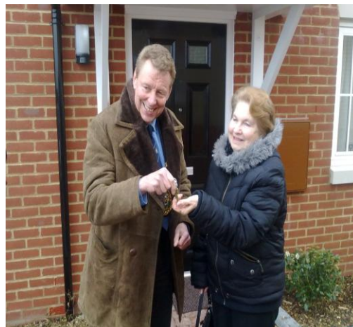
English Rural Housing Association