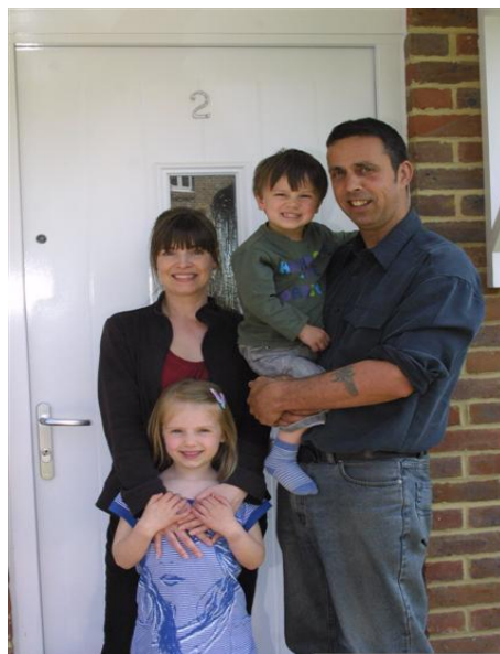
Local family move in