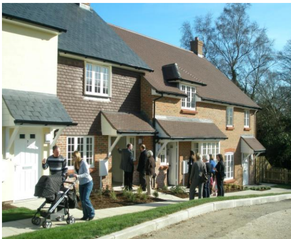
English Rural Housing Association

Engaging early, consulting on potential sites, initial proposals and building design and quality in an open and transparent manner will help to build trust amongst local residents and a feeling that they are part of the process and not having development "done to them".