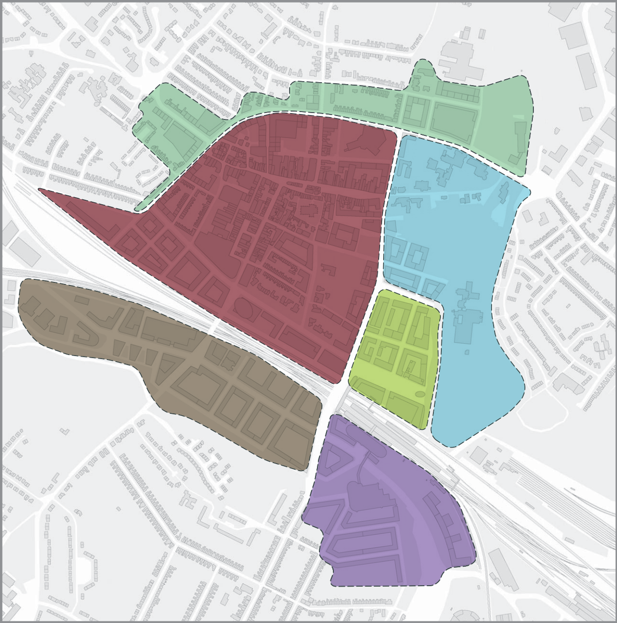
Built Form and Urban Quarters