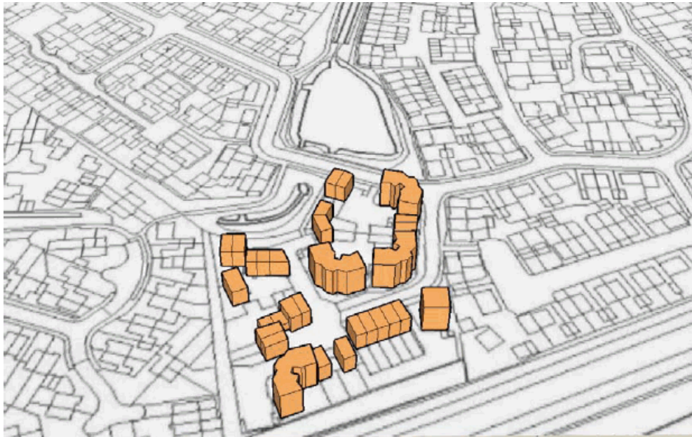
Picture 2 Unacceptable concentration of affordable housing on a site.

33 Affordable housing must be integrated with market housing and distributed across the development. The perceived marketability of private housing within a development will not be considered a suitable justification for clustering of affordable housing beyond the guidelines set out below.