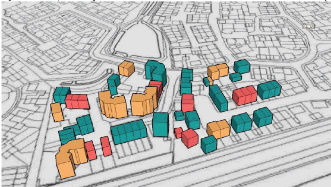
Picture 1 Clusters of equal or greater number of market housing units must separate clusters of affordable housing units.

31 The integration of affordable housing within larger developments is a key issue in the Council's assessment of the quality of design and layout of schemes. The Government's approach in PPS1 (par.35) is clear in promoting the need for high quality and inclusive design that should create well-mixed and integrated developments that avoid segregation. The guide on 'Delivering Affordable Housing (Nov, 2006 – CLG) also challenges developers to produce high quality housing designs that help to integrate affordable and market units in a mixed community.