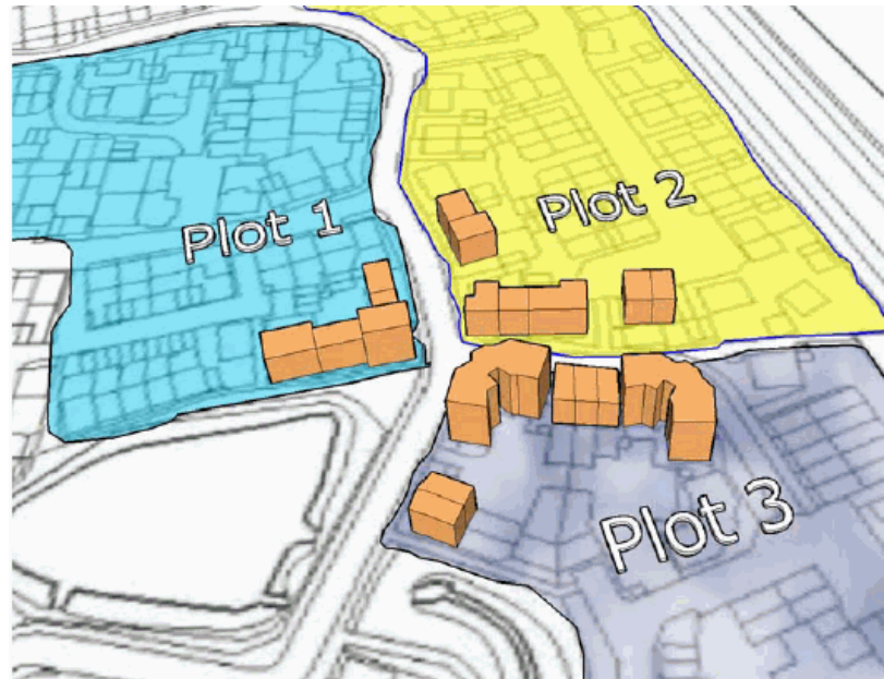
Picture 3 The use of roadways paths and other access ways will not be considered as sufficient separation between clusters.

39 In the case of specialist housing provision to cater for particular needs (eg. supported housing) the Council may permit exceptions to the principles set out in this SPD. Thus, for example, the Council may permit extra care sheltered housing to be in clusters of around 40 units and may permit specialist housing for those with learning disabilities or mental health problems to be in clusters of 8 units or less. Such cases will be judged on their individual merits.