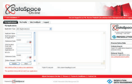
DataSpace On-line Screenshot