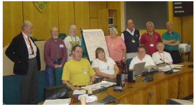
Forum Members take a break for a photograph

Nevertheless our recent joint working has been a success.