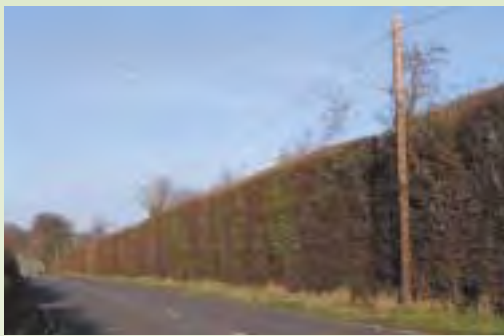
18. Old tall hedges along the A28 Canterbury Road.