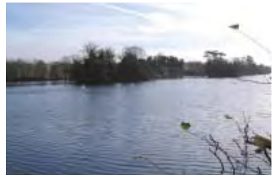
7. Eastwell Lake on which Queen Victoria is said to have skated.

The increasing size and importance of the Eastwell Estate led to the growth of the village of Boughton Lees around the green known as the Lees [8], providing housing for estate workers and trades such as blacksmith, wheelwright, butcher and grocer. Owners of the estate often brought their own staff with them, but local trades also reflect the agricultural nature of most of the local occupations. Because of the importance of the road from Ashford to the port at Faversham, it was one