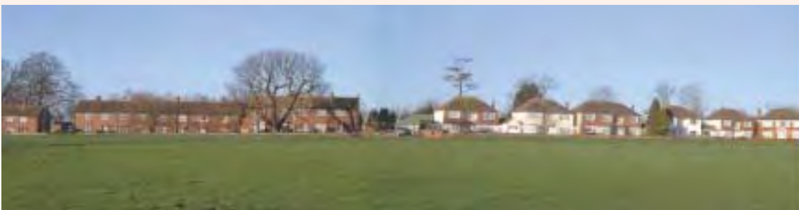
34. Pattern book housing on the west side of the Lees with the original green Iron Room in the centre.

Part of the village is also within the North Downs Area of Outstanding Natural Beauty whilst other parts are in the Kent Special Landscape Area (see map on pages 14 and 15). The settlement slopes gently downwards from west to east giving rise to panoramic views of the Downs to the north [11, B] and east [9, C] as well as the open countryside in between. To the west there are similar views [E] to the grouped trees of Eastwell Park. The built form of the property around the Lees [14, 15, 34] and along the radial roads is almost completely ribbon in nature. The housing density is high on the south side of Wye