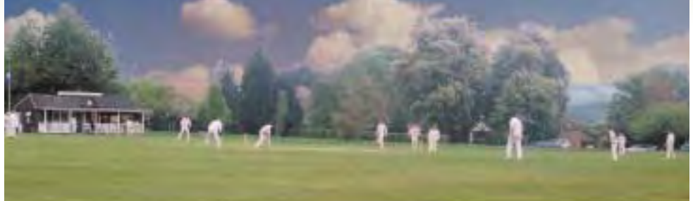
11. Cricket on the Lees with the North Downs in the background.

Great Stour river valley. Apart from Goat Lees and the southern Trinity Road areas, the whole of the parish is within an Area of Outstanding Natural Beauty or a Kent Special Landscape Area (see map on pages 14 and 15). There is a wide variety of soil types throughout the parish, the main ones being chalk, marl, gault clays, sand, gravel and brickearth. The fertile land is extensively farmed with the exception of an area of mixed woodland bordering the northern edge of the parish. The only village in the parish is Boughton Lees, some five kilometres (three miles) from Ashford town centre, on the A251 Ashford to Faversham road. The majority of properties in the village border a picturesque green [8] where cricket has been played since 1798 [11]. It is mostly within a conservation area. The Eastwell Estate was partially surrounded by a brick wall [12, 16], five kilometres (three miles) of which still survive. The other main centre of population is at Goat Lees, a modern development, started in 1998 and yet to be completed. It is built on former farmland on the northern edge of Ashford. The other main road running through the parish, near its eastern boundary along the Great Stour river valley, is the A28, Ashford to Canterbury road.