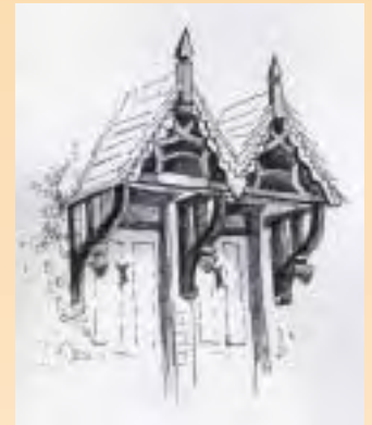
55. Door canopies on Eastwell Terrace, Wye Road, Boughton Lees