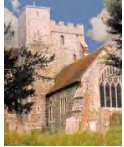
5. All Saints' Church, Boughton Aluph. First built in the 13th century of flint and rubble with ashlar dressings.