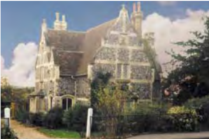
43. Stone House, Faversham Road, Kennington. Jacobean style house in knapped flint with ashlar bands, quoins and dressings

more modern buildings include a leisure centre [23] adjacent to the hotel and several buildings, large and small, required for the estate's present agricultural usage.