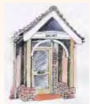
58. Porch at Wide View, Lenacre Street