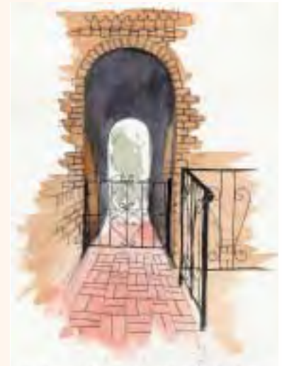
62. Alleyway in Prospect Cottages, Wye Road, Boughton Lees