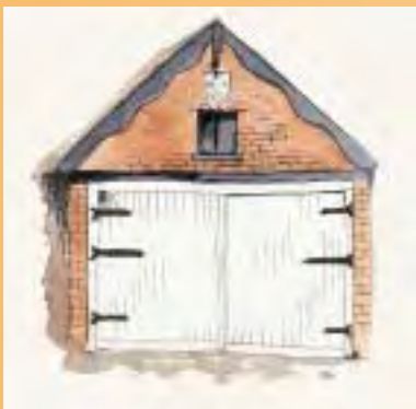
61. Garage built in the style of the 1835 house at Jackets Field, White Hill . Note pilgrim plaque in gable apex.