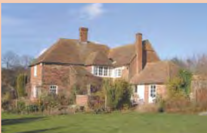
39. The Brewhouse, Malthouse Lane, Boughton Aluph. 17th century timber framed house with 18th century cladding.