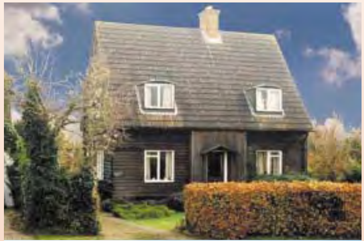
37. Colt type timber house at Boughton Lees. Note beech hedge.

Four other properties of various ages and styles are in Church Lane one of which has undergone recent extension that is in keeping with its original character. Along the northern end of Pilgrims' Way there are five individually located and styled properties varying in age from Victorian to post Second World War. Some have distinctive features such as hanging tiles and cat slide roofs. In the middle part of this lane is a more closely grouped cluster of older buildings, some listed, which by their names reflect the earlier brewing activities in this area - Malthouse Farm and Cottages and The Brewhouse [39].