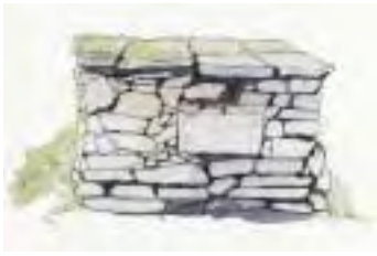
48. Reputed tomb of Richard Plantagenet in Eastwell Churchyard