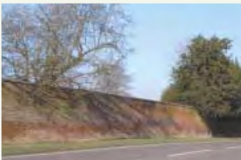
16. Listed kitchen garden wall. Part of the Eastwell Estate boundary wall.

North Downs Way footpath. There are also far-reaching views of the North Downs above Eastwell Park from Sandyhurst Lane [G] and Trinity Road [J].