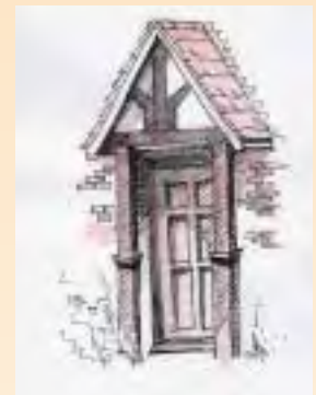
56. Porch at Goat Lees