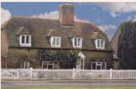
31. Picket fencing to the circa 1700 timber framed Lees Cottage, Boughton Lees.

Boughton Lees lies close to the base of the escarpment of the North Downs taking the form of a triangle [8] around the village green, with radial roads running out from each corner. Most of the village lies within a conservation area that came into being on 19 February 1987. The character of the Conservation Area stems from the village green, the spaces between the buildings and the buildings themselves, which are of varying individual quality and age. The Lees itself is of the highest value as an open space within the Conservation Area and is of more than local significance due to its location on a major distributor route to and from Ashford town. Taken together these aspects make up an important village scene in terms of