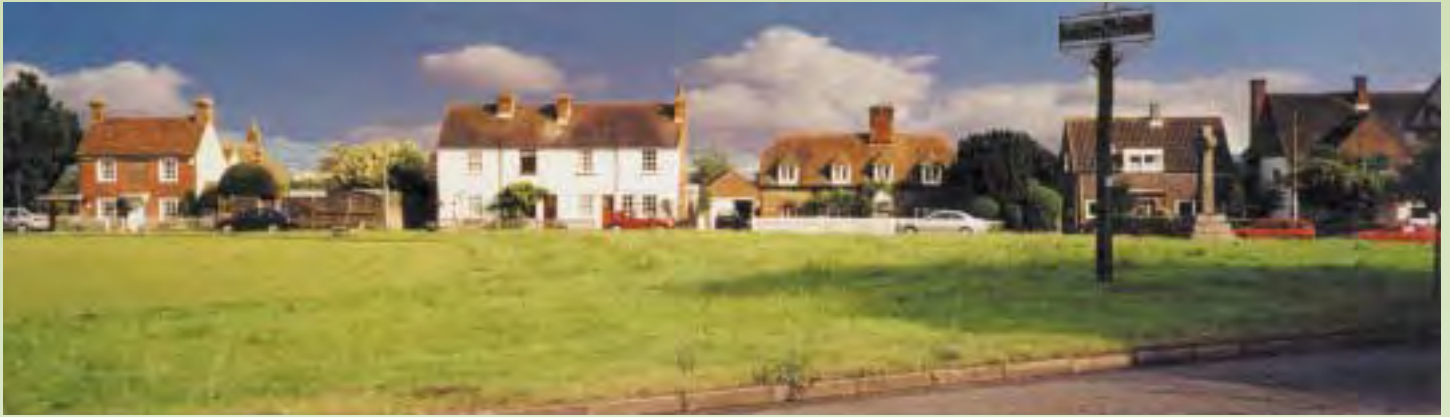
14. South-east side of the Lees. Note different roof lines.

The edge of Boughton Lees is reached at about 70 metres (230 feet) above sea level where the listed estate wall [16] on the right rises to enclose the former kitchen gardens of Eastwell House. As the road levels out the village green comes into view, with houses built around its sides [8]. The houses bordering the green are well spaced [14, 15] providing open views across farmland and orchards to the downs [B, C]. The openness of the views is highly valued as a vital part of the character of the village and is recognised as such by its status as a conservation area.