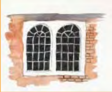
59. Dering style window in The Old Barn, Wye Road, Boughton Lees