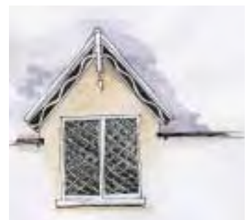
53. Fretted gable on Rose Cottage, Boughton Lees