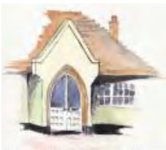
49. Porch to Plantagenet Cottage, Boughton Lees