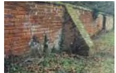
12. Eastwell Estate boundary wall in Lenacre Street.