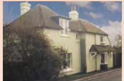
30. The Old Gatehouse, Kempe's Corner, was once a toll house.

Whilst the buildings in the more rural areas have not been subjected to more modern development in their close proximity, others, particularly around the Lees and in Wye Road, have. Fortuitously, this development has been piecemeal over the years, fitting in with the traditional pattern of development so that the character of the settlements has been preserved. The presence of the listed properties has been maintained. The uniqueness of these areas has been sustained.