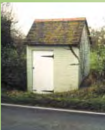
25. Tollbooth at Kempe's Corner