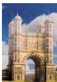
Front Cover: "Eastwell Towers" built in 1848

Boughton Aluph and Eastwell Parish Design Statement is part funded by each of the following