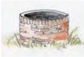
47. Plantagenet's Well in Eastwell Park