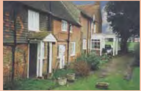
32. 17th century Pilgrims' Cottage in the foreground and the 18th century Hobday Cottage to the rear with the Lees in the background.