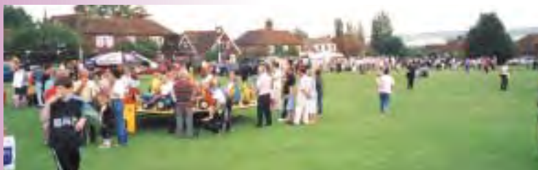
9. Boughton Lees village fayre with a view of Wye Downs in the right background.

of the first roads to have a turnpike. The Flying Horse Inn [4] was used as a staging post and clusters of houses grew up around the green, rather than around either of the two churches. The village green [8], recorded as the site of a fair since Plantagenet times, is still used for village events which include the annual fayre [9].