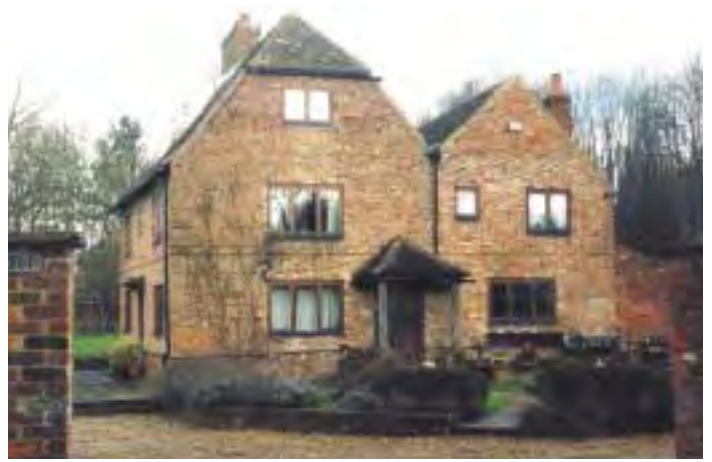
40. Sandpit Cottage, Sandyhurst Lane. Well restored 17th century (left) and 18th century (right) timber framed house.

Situated in the south-west of the parish, Sandyhurst Lane encompasses assorted building styles in a largely rural setting. One of the most important features of the lane is the open aspect along almost the entire length of the northern side with far-reaching views [G] of the North Downs. This is a cherished and important feature of the lane, which includes the recreation ground of Sandy Acres. Beyond this a footpath leads to a coppiced area with a pond, which is an important wildlife and wildflower area.