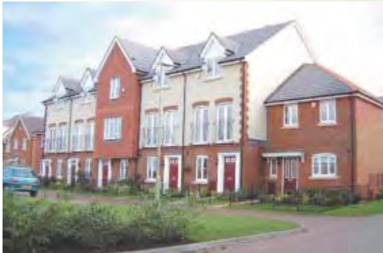
20. Iron railing to three storey town houses at Goat Lees.