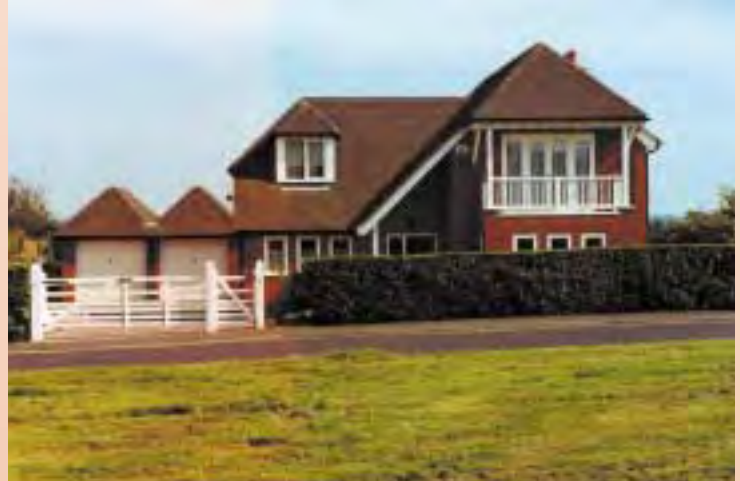
38. Replacement property – Boundary Cottage, Boughton Lees, built in 1996. Note reflected feature of the cricket pavilion.