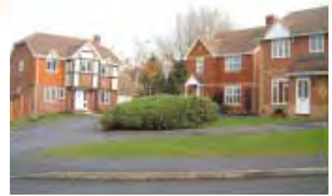
26. Quiet cul-de-sac in Goat Lees. Note hanging tiles, timbers, plain roof tiles and chimneys.

The parish has a diverse mixture of buildings ranging from ancient churches, medieval houses and farms to modern housing developments. Most buildings are private dwellings. The large majority are detached properties with very few semi-detached and some terraces. A typical village scene prevails at Boughton Lees, with properties on three sides of a village green [8]. There is a mixture of linear development along older roads and lanes but the majority of modern housing is clustered in culs-de-sac as at Goat Lees [26].