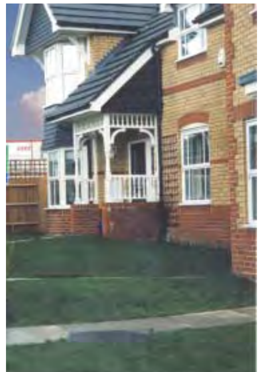
45. Porch and gable at Goat Lees

All dwellings are in clusters of quiet culs-de-sac [26] which are beginning to form their own neighbourhood identities and sense of place within the development as a whole. The new homes simulate various building periods popular with the developers' current design book, which may not necessarily mirror the property designs in the locality. Nevertheless, the layouts have a degree of visual interest avoiding monotony with some attractive integrated groupings around semi-private places [26]. Roof lines are at various heights and three storey homes have dormer windows [20, 60]. Most frontages are open-plan [26], creating visual space and consistency through blended planting. On the town houses there are attractive railings [20] to frontages maintaining the town style and supplementing the urban to rural transition.