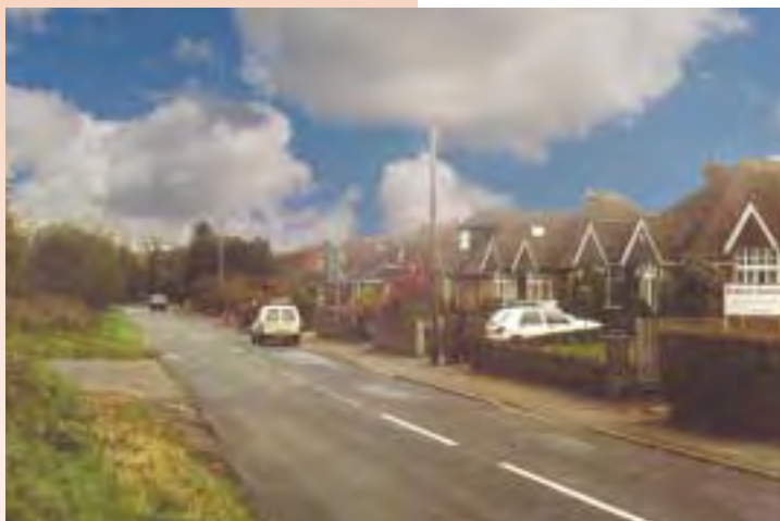
41. Bungalows in Sandyhurst Lane

There are two modern small developments at the eastern end of the lane. Watson's Close, built in the 1990s, consists of 10 executive Tudor style houses [22] that have pleasant brick and wood detailing. Pondfield, a smaller development of three properties, is set back well from the road with good landscaping.