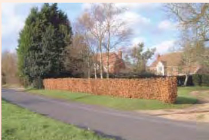
35. Beech hedge to Chestnut Lodge, Boughton Lees. Infill housing at Denelees in the background.

The buildings are a mosaic of different ages, types, styles, density, position and materials with no clear-cut dividing lines. This mix of old and modern works well by imparting a feeling of non-conformity, maturity, variety and a softening of the village scene with no one dominant style. This is the result of each period adding to the variety of buildings in