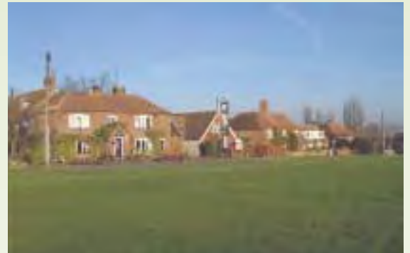
15. Alternating old and modern buildings on the north side of the Lees.

The views from within the village of Boughton Lees are extensive open panoramas [9, B, C] to farmland, orchards, patches of woodland, scattered houses and farms and the North Downs on both sides of the Great Stour river valley. Parts of Ashford [D] and Wye [B] are visible in the distance. The houses to the west of the Lees have views to Eastwell Manor [67, E] across its parkland. This scenery with pasture and fine trees surrounding Eastwell Manor, the ruined Eastwell Church [6, 68] and the lake [7] are further delights. So too is the setting of All Saints' Church, Boughton Aluph [5, 69] with its attractive broad distant views [17, F], which make it a well-appreciated stopping point on the