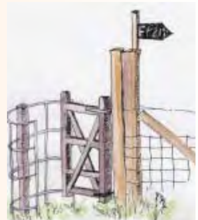
63. Kissing gate on footpath near Eastwell Church