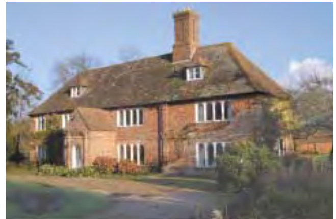
27. The Manor House, Faversham Road, Boughton Lees. 17th century manor house with Dering windows.

The Ashford Borough Local Plan for the period up to 2006 states that residential development will not be permitted in Boughton Lees (Policy HG5). Nor does it have suitable opportunities for either minor development or infilling in respect to more housing (Policy HG6 and Clause 5.34). Similarly new development in the countryside will not be permitted except in special circumstances e.g. an agricultural or replacement dwelling (Policy HG7). Goat Lees is in its final phase after which no more housing is scheduled.