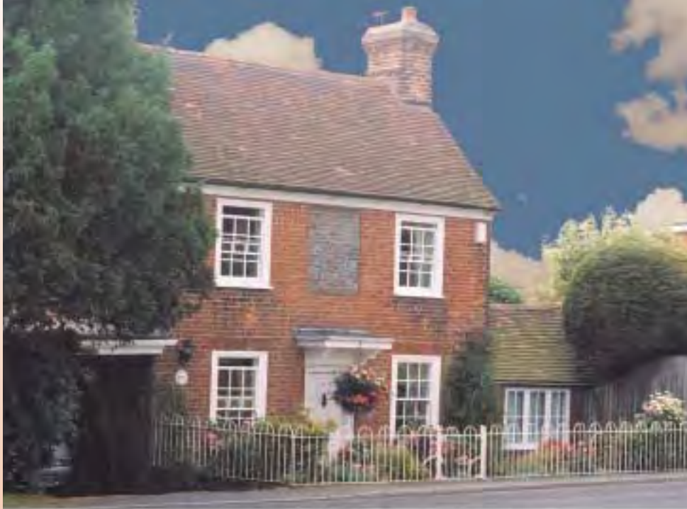
44. 19th century hooped railing to Hobday Cottage, Boughton Lees. Note styled extension and bricked-up window void.

Goat Lees is situated on the new Trinity Road joining the M20 (junction 9) in the south with Faversham Road (A251) in the north near Eastwell Towers. The development forms a transition between urban Ashford and the rural areas of the parish. The southern approach is undulating and planted in areas with native shrubs and trees. Small pockets of thicket and undergrowth have been preserved for wildlife conservation and to soften the line between the new buildings and the surrounding farmland. The development follows the undulating landscape and merges with the North Downs visible on the skyline [J].