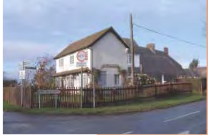
42. Cornerways, Lenacre Street, has a well designed extension.

They include the parish's oldest dwelling, Lake House [29], the largest house, Eastwell House, now Eastwell Manor Hotel [67] incorporating the former farm and stables and St Mary the Virgin Church [6, 68], now a ruin. Other notable buildings including the distinctive Eastwell Towers gatehouse [front cover] and its flanking walls [19] and the lakeside Pump House were related to the estate's management. The few