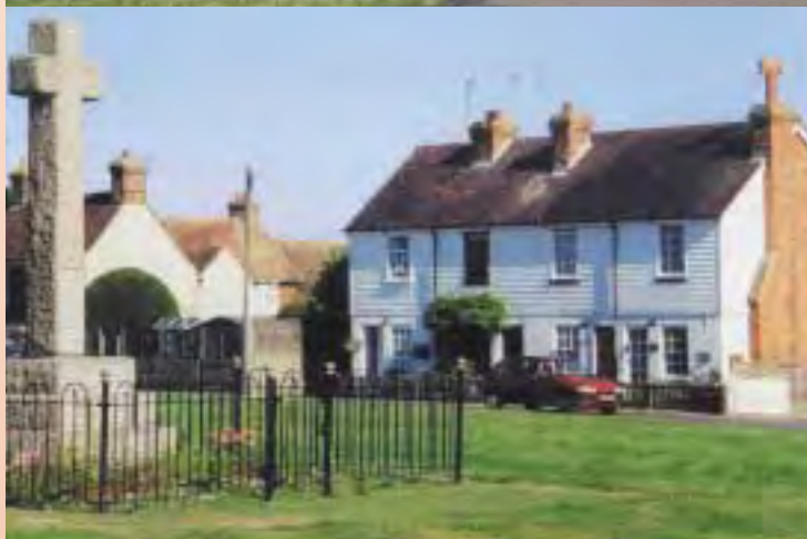
36. Victorian Hobday Cottages and the War Memorial.

a different way. It is not unusual to see the old (some listed) interspersed with buildings of the post Second World War period [15]. Only 37% of the buildings in the village were built after the Second World War. There is little relationship between individual adjacent properties except those in Wye Road [1] and the buildings on the west side of the Lees [34]. Buildings of the twentieth century follow the original building lines which are set back from the road. There are no housing estates. Buildings in this wide variety of styles have produced a pleasing overall appearance because of their sympathetic relationships in terms of scale, height, massing and alignment [14]. The weathering of materials has also had a unifying effect.