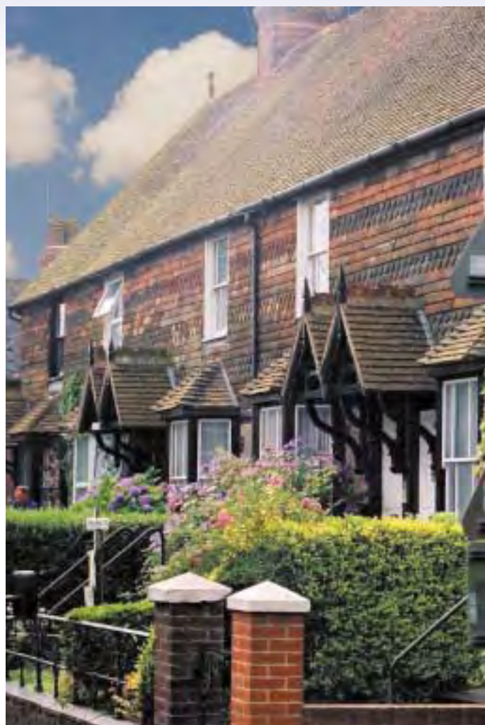
1. Eastwell Terrace, Wye Road, Boughton Lees