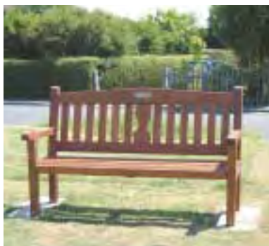
65. New memorial seat on the Lees

Street lighting is almost completely absent in Boughton Lees and the rural area, being restricted mainly to road junctions. Lighting in any quantity is confined to Goat Lees. The only traffic lights in the parish are situated at the junction of Trinity Road and Faversham Road.