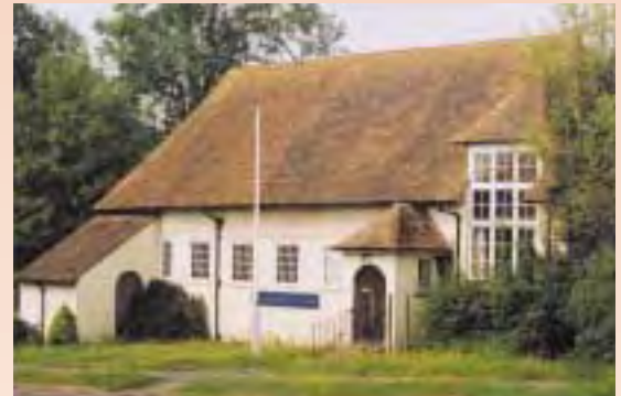
33. St Christopher's Church, Boughton Lees. Timber framed 15th century house enlarged in the 19th century.

Part of the village is also within the North Downs Area of Outstanding Natural Beauty whilst other parts are in the Kent Special Landscape Area (see map on pages 14 and 15). The settlement slopes gently downwards from west to east giving rise to panoramic views of the Downs to the north [11, B] and east [9, C] as well as the open countryside in between. To the west there are similar views [E] to the grouped trees of Eastwell Park. The built form of the property around the Lees [14, 15, 34] and along the radial roads is almost completely ribbon in nature. The housing density is high on the south side of Wye