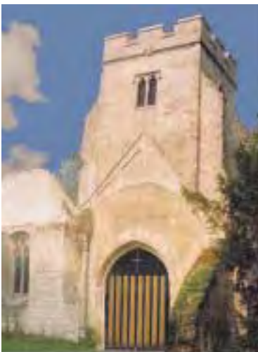
6. St Mary the Virgin Church, Eastwell. Fell into ruin after a storm in 1951.

EASTWELL , a parish of wells, also dates back to Saxon times when a thane, Frederic, held the lordship of the manor from King Edward the Confessor. The ownership of Eastwell Estate has been documented from the Domesday survey onwards. In 1918 it is reported that 2,600 acres of land and 60 estate properties were sold at public auction. In many cases the tenants of the properties and land became their owners. The remaining estate now covers about 1200 hectares (3,000 acres), much lying in neighbouring parishes.