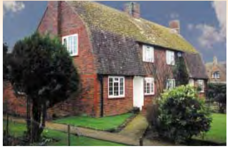
50. Seaton Cottages, Pilgrims' Way, Boughton Lees

In common with much of East Kent and the Kentish Weald, the majority of the older buildings scattered throughout the parish are built for the most part with locally produced bricks. Some have tile hanging or white painted weatherboarding and in rarer instances oak framed wall panels infilled with white painted lathe and plaster or brick. All have steeply pitched plain tile roofs with a variety of shapes and styles of chimneys. The carefully considered scale and positioning of window and door openings and the resulting relationship of solid to void in walls have contributed to the distinctive Kentish character of these older buildings. Most of these buildings have white painted timber framed windows and wood panelled doors. Throughout the parish there are many fine examples of Dering style windows [4, 27, 28, 51, 59] with stone surrounds and mullions, iron casements or fixed lights together with the occasional Dutch style brick gable [43, 52], both of which are typical features of this part of Kent. Many of these older buildings have been renovated and extended using reclaimed traditional materials or new materials that match the original in texture and colour. Whilst a distinctive style of porch or canopy is not a traditional feature of the parish, many older houses have been designed with these features [58] as an integral part of the façade that enhances their overall appearance. Fine examples of door canopies [1, 55] are those to Eastwell Terrace in Wye Road.