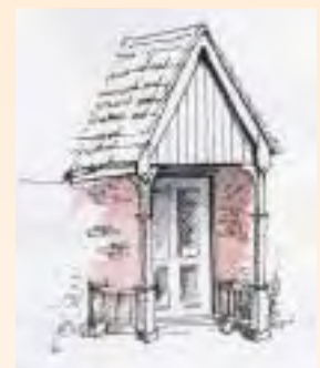
57. Porch at Goat Lees