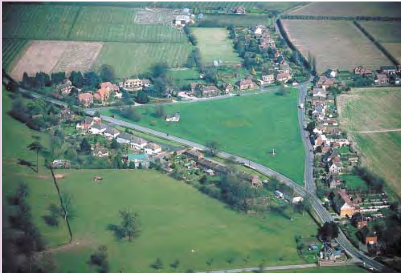
8. Aerial view of Boughton Lees.

of the first roads to have a turnpike. The Flying Horse Inn [4] was used as a staging post and clusters of houses grew up around the green, rather than around either of the two churches. The village green [8], recorded as the site of a fair since Plantagenet times, is still used for village events which include the annual fayre [9].