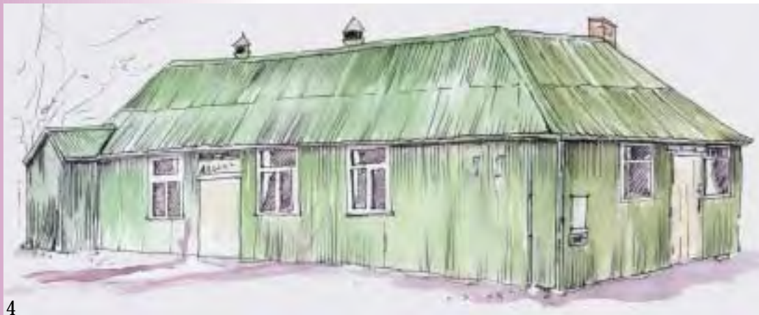
10. The Iron Room, Boughton Lees.

The parish had a small increase in population from 1801 to the 1930s when more households are recorded, much of the newer building being infilling along the established roads. The 1991 census showed the population to be 695 and in 2001 it was 1218.