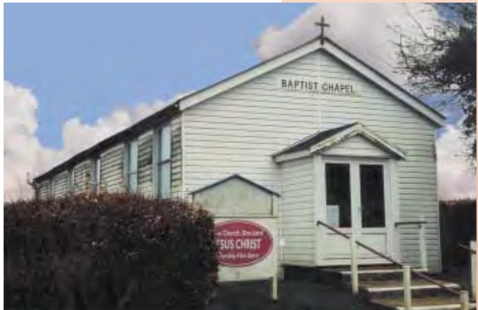
46. Baptist Chapel, Wye Road, Boughton Lees

Property boundaries throughout the parish are a mixture of traditional materials, from older walls, of which the magnificent red brick and part flint Eastwell Estate wall [12, 16] is the most prominent example, to the new red brick [54] and part timber panel walls along Trinity Road. Individual houses are mostly bounded to the front by brick walling or hedging [22, 35, 37, 38] with the occasional length of timber panelling, picket fencing [31] or more rarely iron railing [1, 20, 44]. In the newer developments of houses, open fronted boundaries are more in evidence [26, 45].