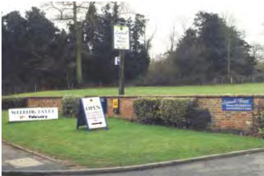
64. Advertising signage and the estate wall at the entrance to Eastwell Manor, Faversham Road, Boughton Lees

The road directional and speed restriction signage in the parish is generally located at a low level and kept to the minimum required for traffic safety. The important rural and landmark building views at the junction of Sandyhurst Lane with Lenacre Street and Faversham Road [19] have not been too severely compromised. Following Parish Council and Highways Department consultations, new signage has been installed at the Sandyhurst Lane / Lenacre Street junction which, together with some repositioning, has improved the visual aspect as well as benefiting motorists. Signage at the other major road junctions at Boughton Lees, Kempe's Corner and Boughton Corner are also considered to be in keeping with minimal road safety requirements.