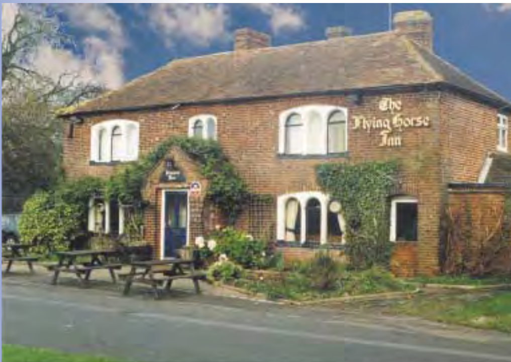
4. The Flying Horse Inn, Boughton Lees. Originally built in the 17th century as a timber framed building on an L-plan footprint. Note red brick cladding and Dering windows.

Where text relates to a photograph or sketch, the number of the same is shown in square brackets after the relevant point in the text. Letters shown in square brackets refer to the view symbol on the map on pages 14 and 15.