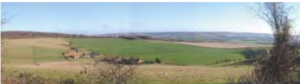
13. View from Challock Hill on the A251 of the Great Stour valley with the Wye Downs in the distance and Warren Farm in the left foreground.

Fine views of varied countryside, both near and distant, frame all approaches to the parish. From the northern edge of the parish, at 182 metres (597 feet) above sea level, the A251 road runs through King's Wood with its sweet chestnuts and a carpet of bluebells [3] in the spring. The road then steeply descends the North Downs' escarpment, curving to stunning views [13, A] across the Great Stour valley. The land falls away across chalk downland dotted with sheep, to arable land and orchards at lower levels. The road is edged by the wall of the Eastwell Estate to the right and by hedgerows and a mixture of native trees to the left.