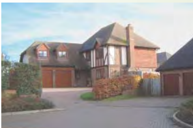
22. Tudor style house in Watson's Close, Sandhurst Lane. Note brick pavers and beech hedge.

The mixture of arable land, grazing, woods, hedgerows, orchards and gardens provides a wide variety of habitats for wildlife. In particular the hedgerows, orchards and mature native trees are homes for a large number of bird species. Kestrels, sparrowhawks, woodpeckers and several species of owl are frequently seen, and the traditional tile hanging and weatherboarding of older buildings provide daytime roosts for bats. Eastwell Lake [7, H] is home to many native wildfowl, and is an important site for migrating birds. Herons fish on its shores, and kingfishers [21] can be seen darting through the trees bordering this man-made lake. Mammals seen in the parish include fox, badger, stoat, and roe deer.