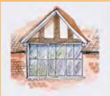
60. Dormer window in Dexter Close, Goat Lees