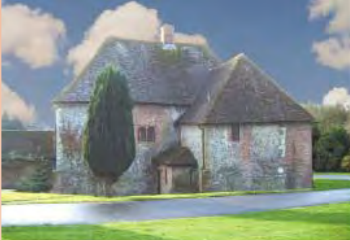
29. Lake House, Eastwell Park is a 13th century hall house. It is the oldest dwelling in the parish.

There are 13 buildings in the Conservation Area at Boughton Lees. These are mainly houses but also include the Flying Horse Inn [4], and its adjacent stables and St Christopher's Church [33]. There are six listed buildings and structures in Eastwell Park [29], including Eastwell House itself [67], the kitchen garden wall [16] and Eastwell Towers. The remainder is widely dispersed throughout the parish with a small cluster at Kempe's Corner [30].