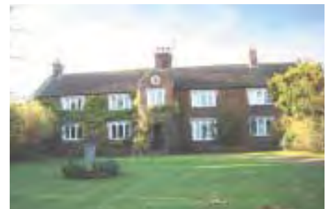
28. Boughton Court, Boughton Aluph. Manor house with 16th century structure over a 14th century crypt. Note Dering windows.

Apart from farming, there is only a small number of businesses in the parish. In Eastwell Park is the Eastwell Manor Hotel and Leisure complex [67] and in Boughton Lees the Flying Horse Inn [4]. The only other substantial business premise is Brakes, a food service company, whose head office is located at the Eureka Science and Business Park on the southern boundary of the parish. In contrast to the other two businesses that are located in older listed buildings, Brakes is housed in a purpose built, modern office block on a green field site. Constructed of red-brown brickwork under a tiled roof, the building commands fine views over farmland, ponds and the nearby Ashford golf course. The buildings have been set below the rising ground to Trinity Road and being surrounded by maturing trees do not dominate their rural setting.