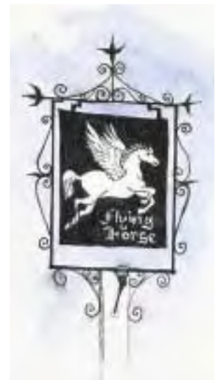
66. Flying Horse Inn sign