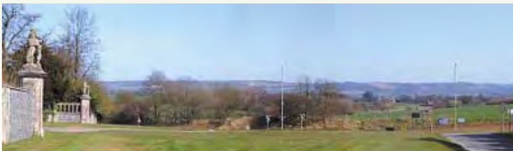
19. Road signage at the junction of Sandyhurst Lane and Faversham Road. The listed wall and statuary in front of Eastwell Towers are on the left with the Wye Crown and Downs in the background.

Many of the roads in the rural parts of the parish are bounded on one or both sides by mature hedgerows of native species of trees and bushes, some of considerable height [18]. In Goat Lees several of the mature trees and hedgerows have been retained. Where hedgerows have been removed most have been replanted or replaced with discrete areas of young indigenous shrubs and trees. Whilst these will take some years to become significant, they will in time play an important role in blending this large development into the surrounding countryside. This type of planting considerably softens the hard edges of the new housing.