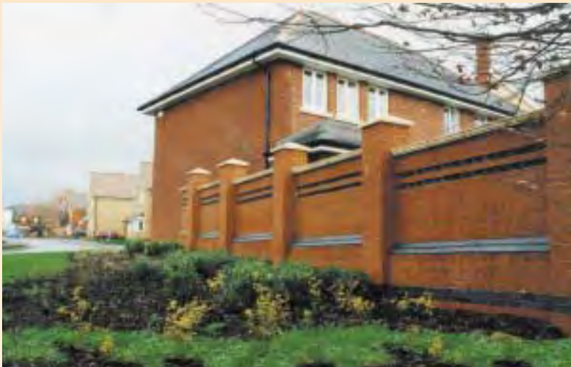
54. Use of red brick in house and wall at Goat Lees

Another parish landmark, built in the mid 1800s, is the red brick boundary wall [12, 16] to the Eastwell Estate. Probably built from bricks produced on the estate, the wall stretches almost continuously from the Boughton Aluph / Challock parish boundary on the A251 to the first bend in Lenacre Street. Parts of this wall have suffered from considerable weather and traffic damage and vandalism, resulting in parts of the wall becoming unstable and falling. A higher section of the wall, to the north of the Lees, forms part of the listed wall surrounding the former Eastwell Estate kitchen garden. The wall is part of the predominant red-brown visual impact of the parish buildings and structures and there is a body of opinion that considers that the whole length of the wall should be listed to aid with its preservation.