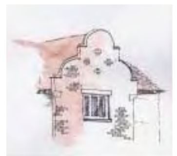
52. Dutch style gable at Goat Lees