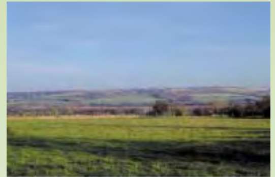
17. The Great Stour valley from All Saints' Church, Boughton Aluph.

When entering the parish from the south along Trinity Road (A251), the landscape has a distinctly manufactured feel because of the housing development of the area. To either side of the road there are wide grass verges planted with trees and shrubs. On reaching Faversham Road and turning left, the Eastwell Towers gateway [front cover], a striking and important landmark in the parish, comes into view. A fine panoramic view [19, M] of the Wye Downs, with its commemorative Crown, can be seen to the right at this point. The road runs for a mile to Boughton Lees around the perimeter of the Eastwell Estate, bordered on the left for the entire distance by a continuation of the same red brick wall mentioned previously, backed by woodland of mixed mature trees. On the right there are views [N] across open fields to the Wye Downs.