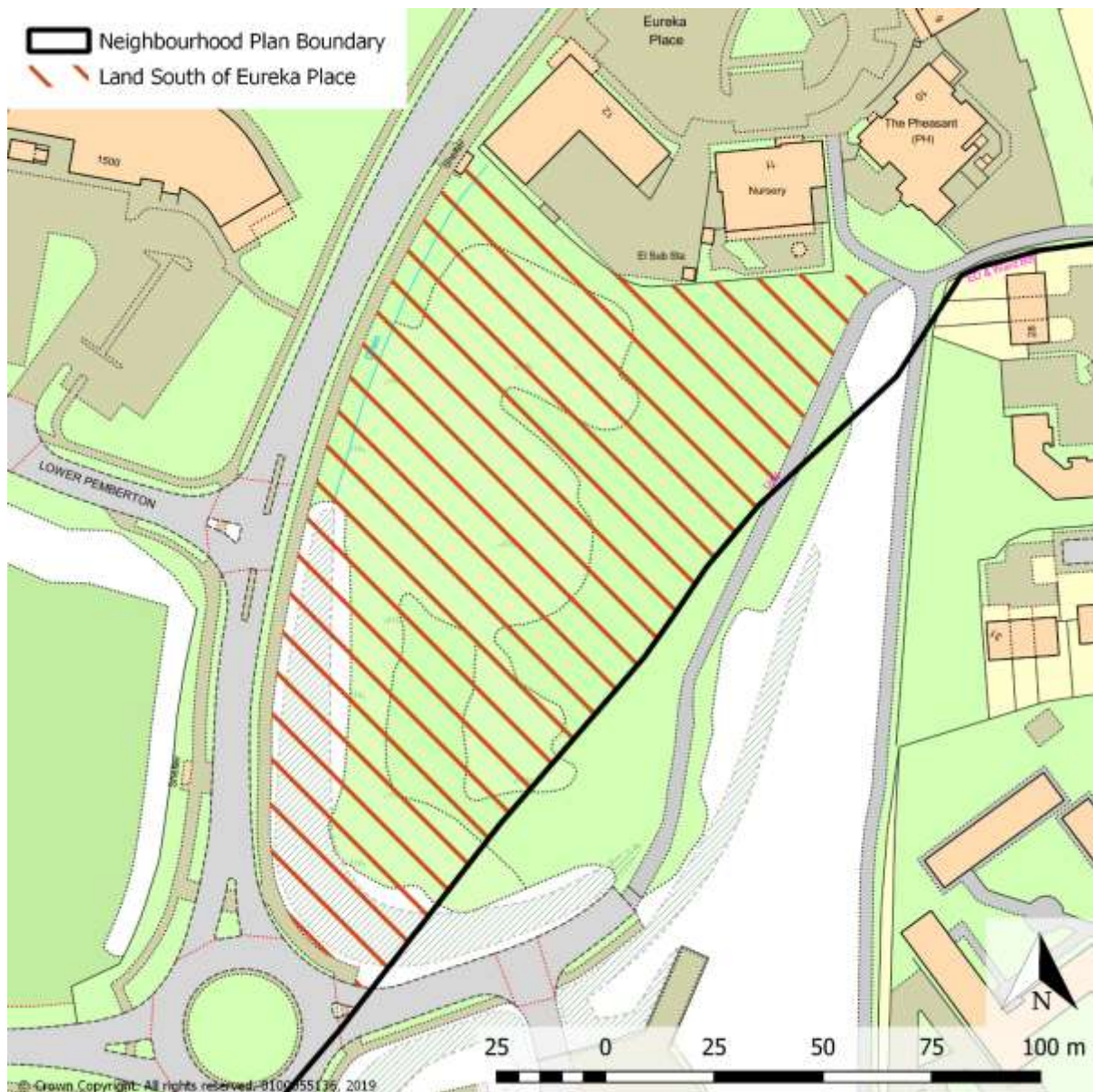
Map 21a – Land South of Eureka Place Local Centre

The site is located within the Eureka Park Local Plan allocation for a ‘higher-order’ business park for the town (Use Class E) and residential development (Use Class C3) and its future use should therefore be within such use classes. However, the mix of uses allowed within Use Class E includes shops and services and the Neighbourhood Plan expresses the ambition for additional local centre uses within Use Class E to be located on land to the south of Eureka Place Local Centre and for this to be addressed through the masterplanning stages for the wider site.