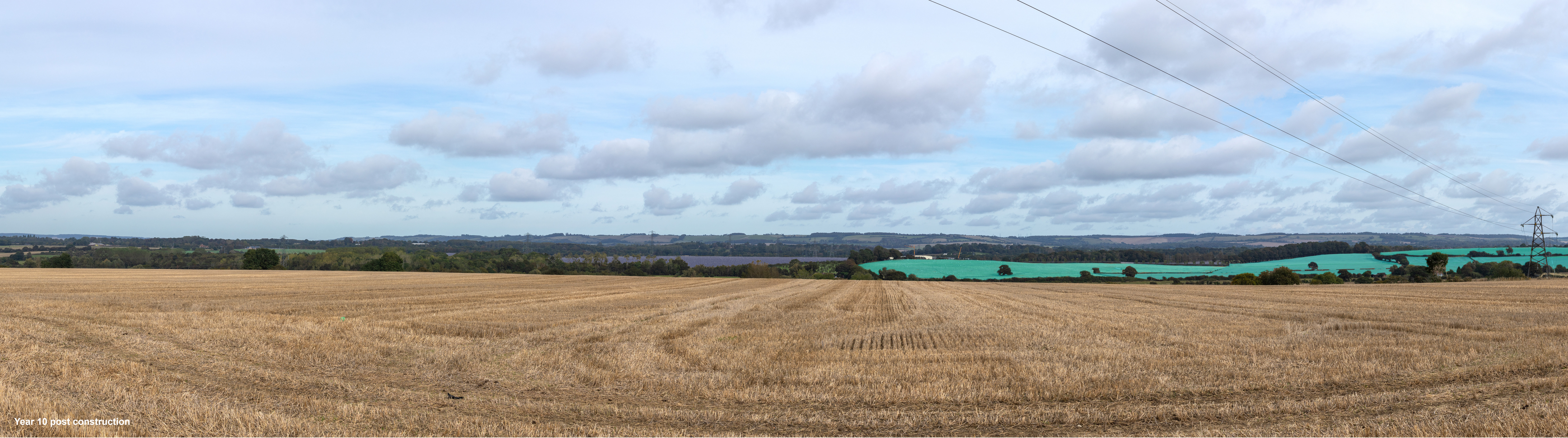
Year 10 post construction