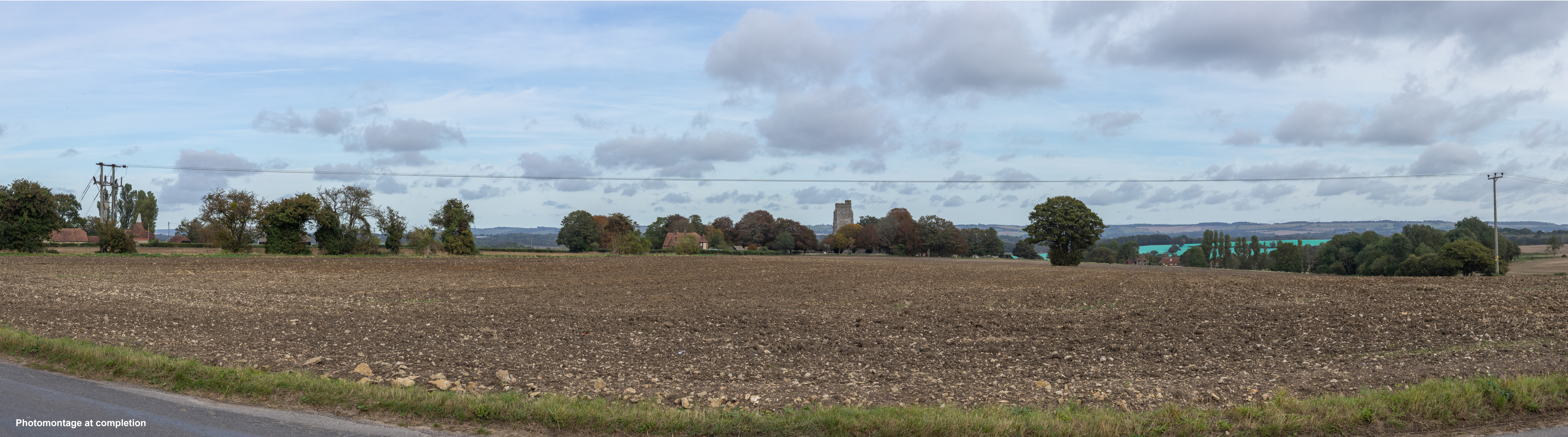
Photomontage at completion