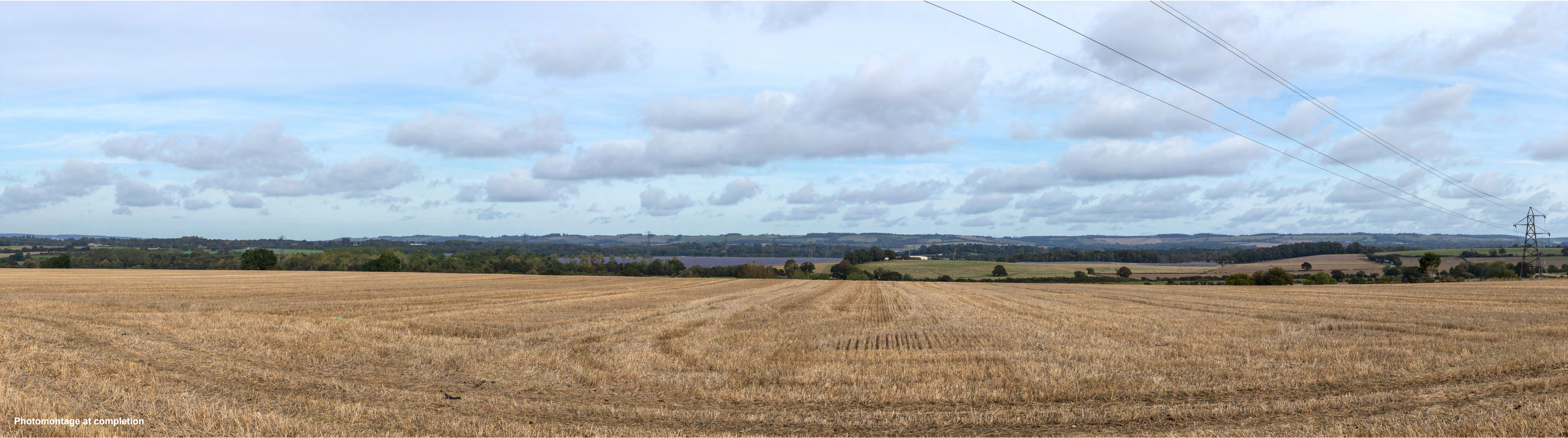
Photomontage at completion

VIEWPOINT 7: Footpath AE474 west of Aldington Revision A