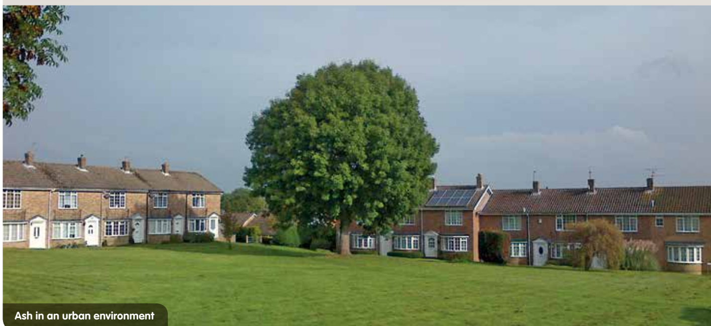
Ash in an urban environment

Leaf litter around ancient, veteran or isolated ash trees of merit and any adjacent ash trees should be disposed of to help protect them from infection.