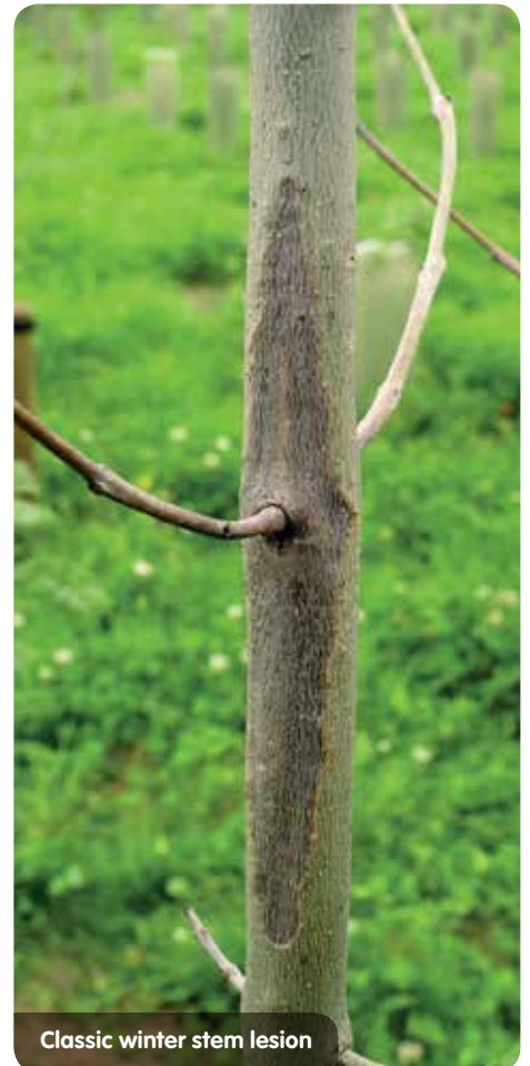
Classic winter stem lesion