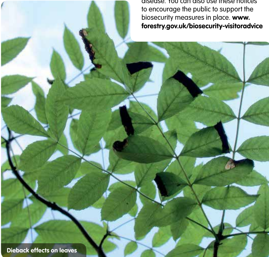
Dieback effects on leaves

Although deadwood might present a hazard, it is also a vital ecological asset. Many species require deadwood for the whole or part of their life cycles, and those species are in turn part of the food chain for many other species.