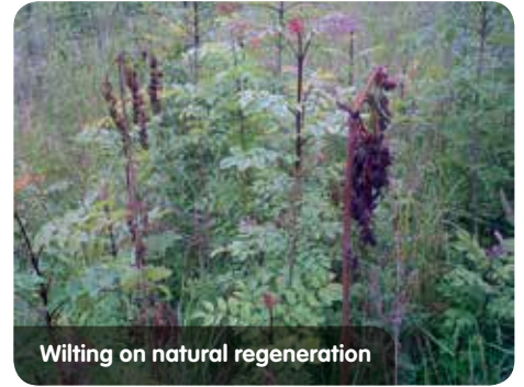
Wilting on natural regeneration

Where public access exists close to infected trees, consider using site notices to let people know about attempts being made to minimise the spread of the disease. You can also use these notices to encourage the public to support the biosecurity measures in place. www.forestry.gov.uk/biosecurity-visitoradvice