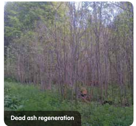
Dead ash regeneration