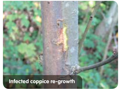
Infected coppice re-growth

Specific advice for arboricultural work is as follows: