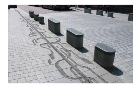
'Flume; design in town centre represents Ashford's close association with water.

This Supplementary Planning Document (SPD) provides guidance for developers on what is expected of them as they bring sites forward. It is essential that the management of water is considered at the earliest stage of a development. By adopting a sequential approach to development site allocation and integrating SUDS into the site design, the maximum benefits can be achieved, for people and the environment. The means of managing water should become an asset to the development and the wider community.