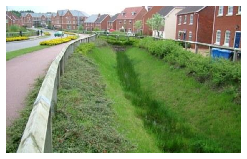
Swale in residential location.

7.15 The Biodiversity index to the Kent Design Guide can be found at http://www.kent.gov.uk/publications/council-and-democracy/kent-design-guide.htm. It also provides useful guidance on general principles of design for wildlife, creating green links, sourcing plant material, ponds and lakes and green roofs. Guidance for designing ponds and wetland to enhance wildlife and amenity provision is also provided in CIRIA C609 (Section 9.11.1) and in CIRIA Book 14.