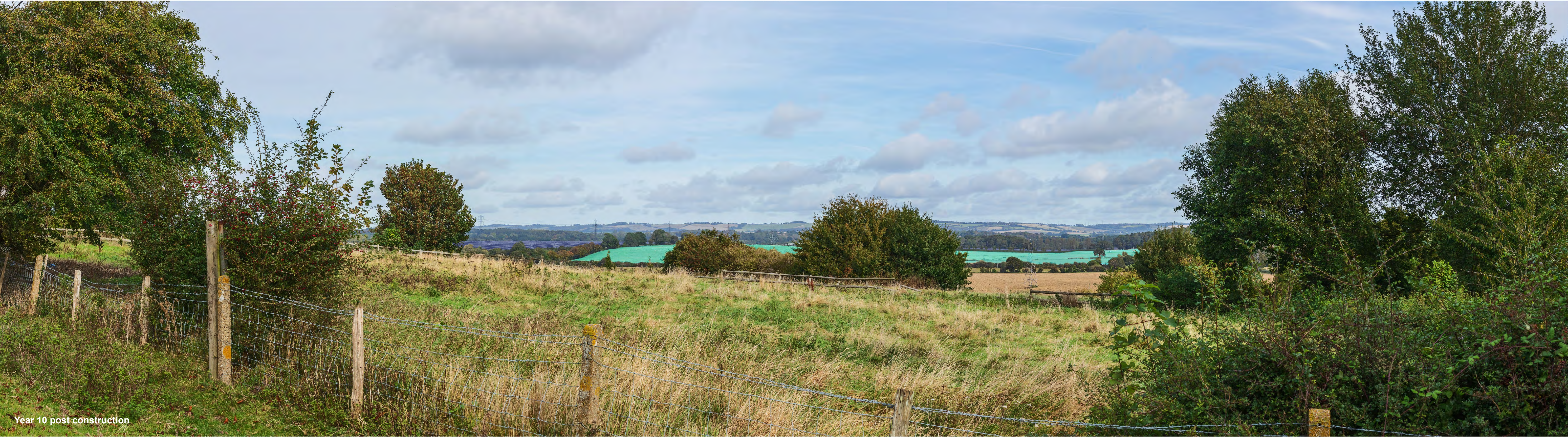
VIEWPOINT 6: Footpath AE477 near Grove Cottage, Aldington SEI FIGURE 11.11 Revision A – VP6 (Layout Refinement), area shaded cyan represents area excluded for ‘Broad visual amenity reasons’ (as per SEI Figure 11.10)